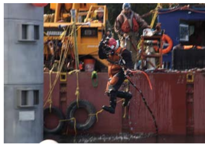
"AAC's use of advanced global positioning systems, pile templates, and cutting edge surveying techniques proved their know-how and skill in even the most demanding environmental conditions."

Last year the AGC of America recognized the project as a Build America Award Winner, the fifth time that AAC has earned the honor. The project, one of only three in the world, allows juvenile salmon and steelhead to pass through dams near the water surface, giving the fish a simpler route and dramatically improving salmon passage by bypassing the dam's deadly turbines.